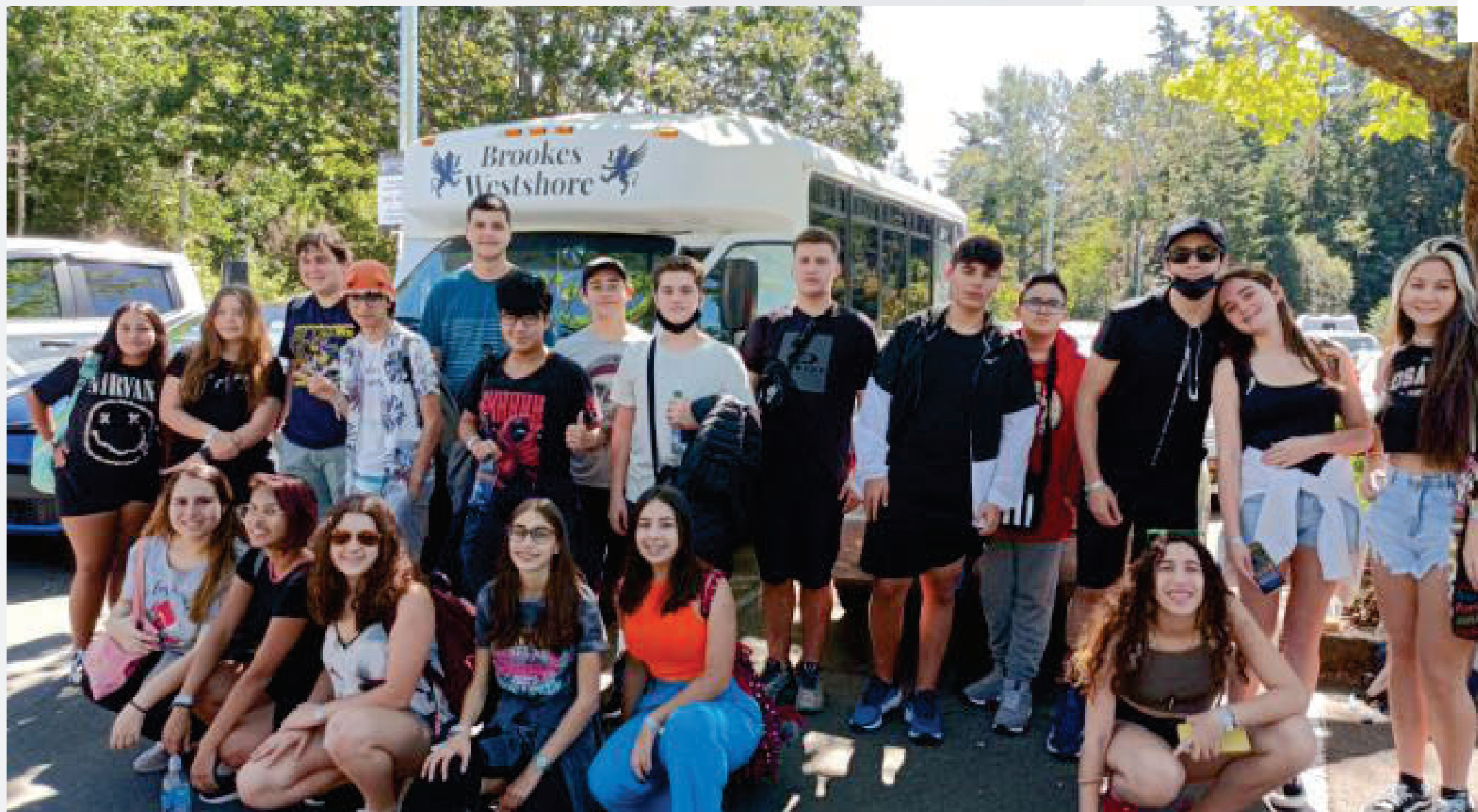
Grupo Efígie - Summer 2022