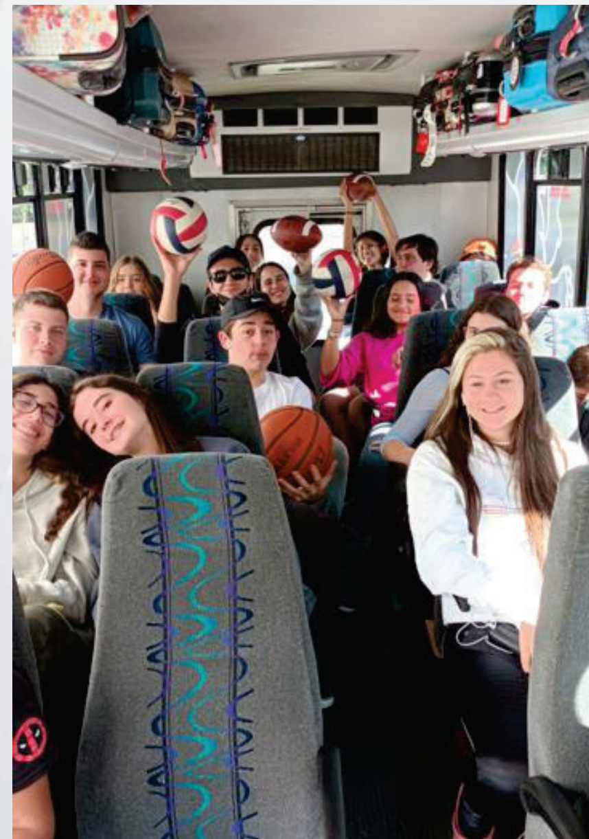
Grupo Efígie - Summer 2022